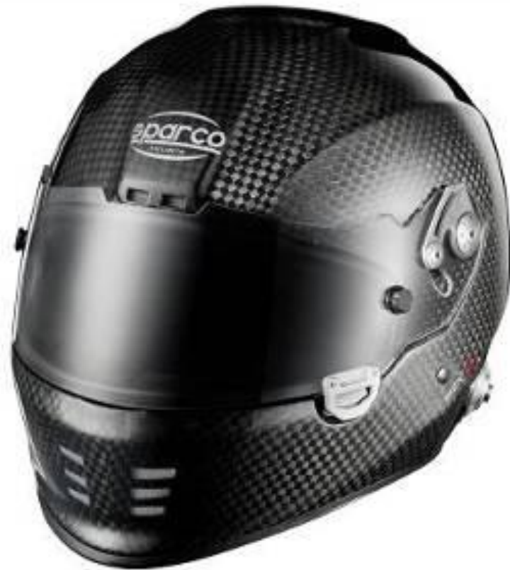
WTX 9 W